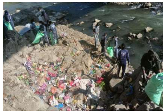
efficient cleanup operation