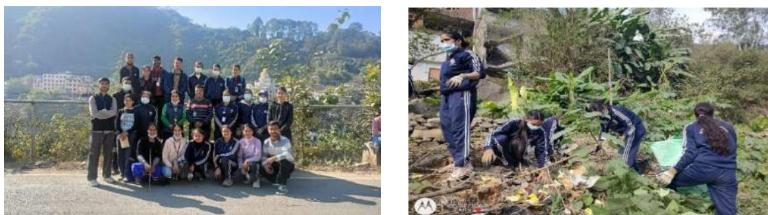
SOME GLIMPSES DURING WORKING

The campaign encountered a slight decrease in volunteer participation, with 78 members actively contributing. However, the reduced numbers did not hinder the effectiveness of the cleanup efforts.