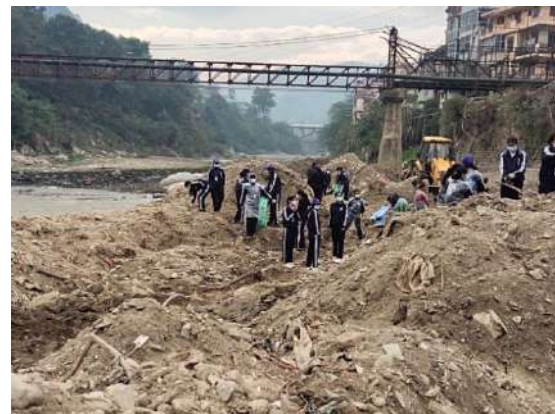
Reduced manpower successfully resulting cleanup operation.