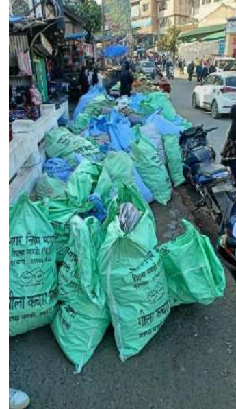
Volunteers: During Waste Collection with collaboration with Municipal Corporation