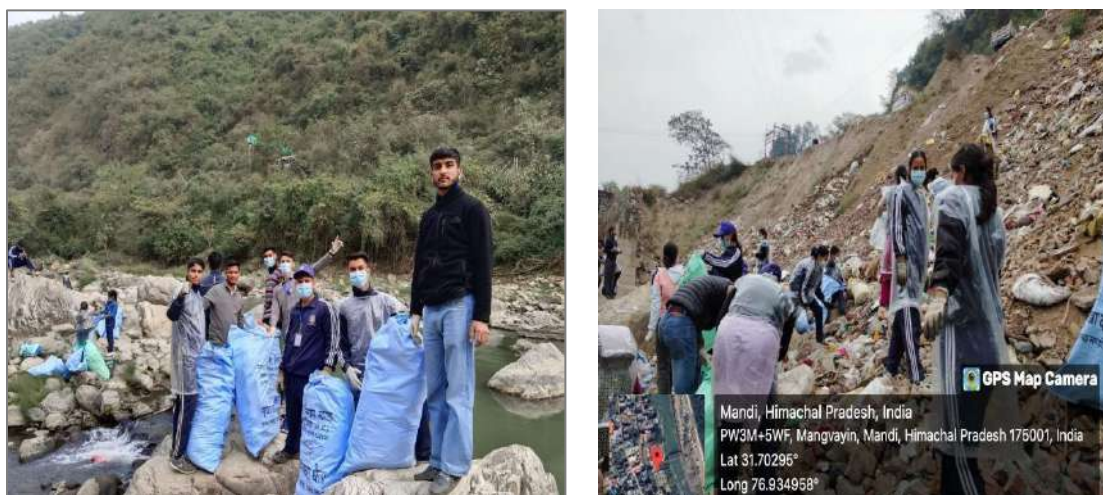
Collecting plastic waste: Location - Near Rani bai, Gutkar, Distt. Mandi H.P. 175001

The focus of the day was on collecting plastic waste, a major contributor to environmental degradation. The volunteers efficiently gathered 1500 kg of plastic waste, significantly reducing the ecological footprint along the Suketi river.