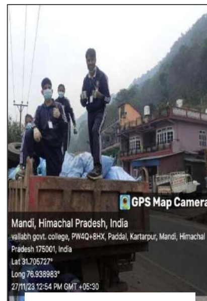
Municipal corporation supporting the campaign