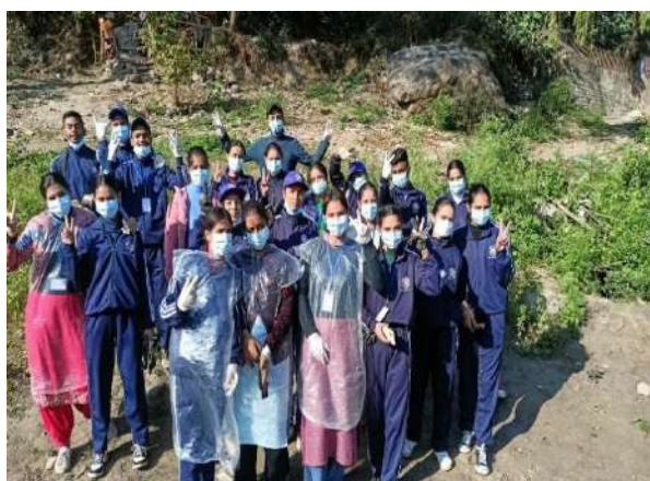
Team work: Worked collaboratively to overcome

The difficult nature of the cleanup work, especially dealing with broken glass, required resilience and teamwork. The volunteers worked collaboratively to overcome challenges and accomplish the mission.