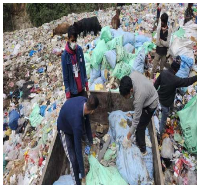
Awareness programs were conducted in nearby villages.