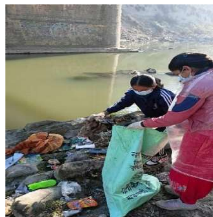
challenges and accomplish the mission