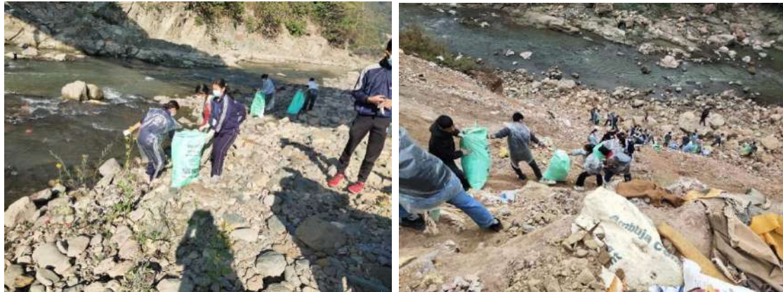
Cleanup in High-Risk Zones

The NSS volunteers strategically identified and navigated through the most challenging and polluted areas along the Suketi river. Their targeted approach ensured the effective removal of plastic waste from regions that needed urgent attention.